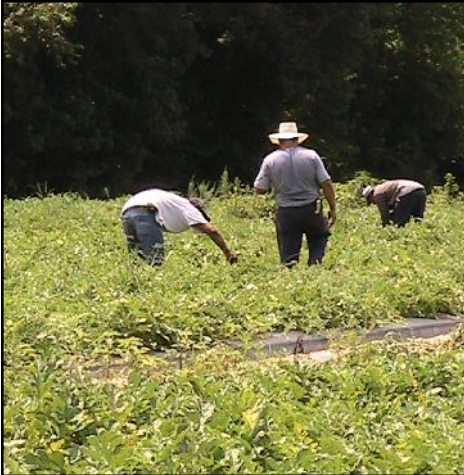
Workers check on crops at Cold Mountain Farm.